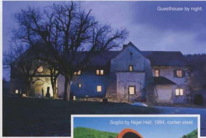
Guesthouse by night.