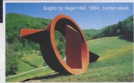
Soglio by Nigel Hall, 1994, corten steel